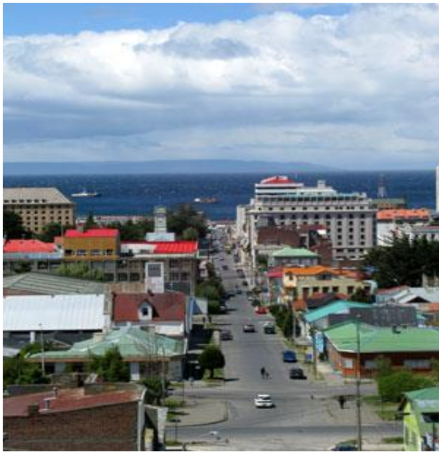
Downtown Patagonia on the Pacific Ocean